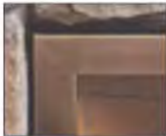
Hand-Rubbed Antique Bronze Trim